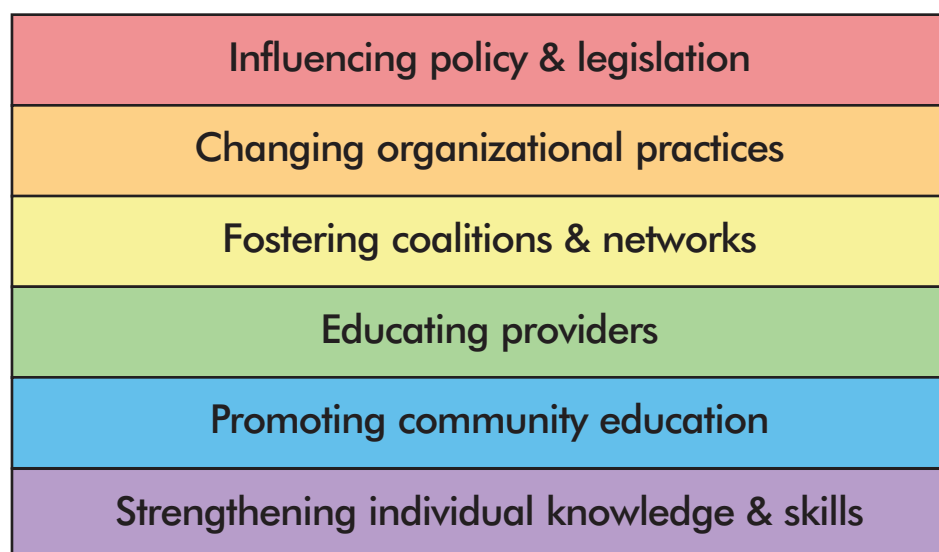
FIGURE 2. THE SPECTRUM OF PREVENTION

The Spectrum of Prevention (see Figure 2) offers a framework for developing effective and sustainable primary prevention initiatives that have the potential to affect community and systems-level changes. The inter-relatedness, or synergy, among levels of the Spectrum maximizes the results of each activity and creates a more transformative force. As Sara Kershner, from Generation FIVE said, “Sustainable models for community education focus on public education tied to collective action. It is not about one project; it is about a community-wide response.” While all levels of the Spectrum are essential for sustaining change, community and systems-level change require efforts at the broadest levels of the Spectrum . These include changing organizational practices and influencing policy and legislation.